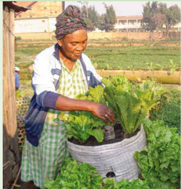
Urban farmer in Antananarivo.