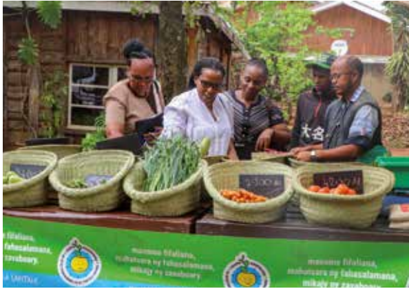
The exchange delegation, including ICLEI, Arusha City Council and Rikolto East Africa officers visit an agroecological produce market (right).

The key outcomes of these exchanges were: