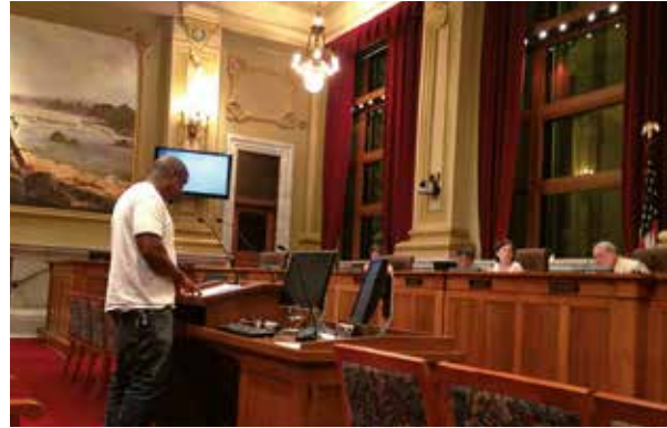
An urban farmer testifies before a City of Minneapolis Council Committee to advocate for changing the urban agriculture policy.

understanding of food systems, he wondered why food did not have its own secretariat within local and even state governments. In the US, state governments scattered food functions among several departments, but there was never an organised and coordinated approach. From the mid-1970s, food as a local issue was beginning to be recognised as farmers' markets and community gardens sprouted up across the urban landscape, and later as food banks mushroomed in response to shockingly high levels of domestic hunger. But other than the occasional municipal grant or a routine regulatory act (e.g. granting a permit for a farmers' market), local government was indifferent to food as a legitimate municipal function.