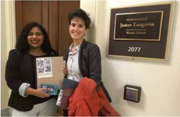
Northeast Sustainable Agriculture Working Group Youth Advocacy Day.