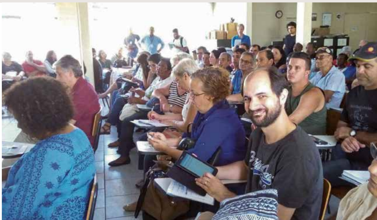
CONASEA-Rio National School Feeding Programme (PNAE) meeting in CAMPO GRANDE.

local farmers, and eventually improve local food production (food for feeding people, not food for commodities or energy use). As a consequence, general access to affordable and fresh food should increase, which helps to ensure local food security.