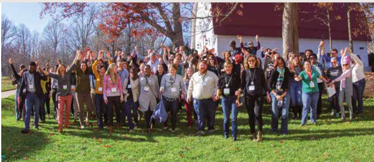
Representatives from 28 food councils in North Carolina meet at the 2017 Statewide Food Council Gathering.