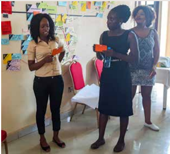
Zambia Food Change Lab participants creating the food system map.