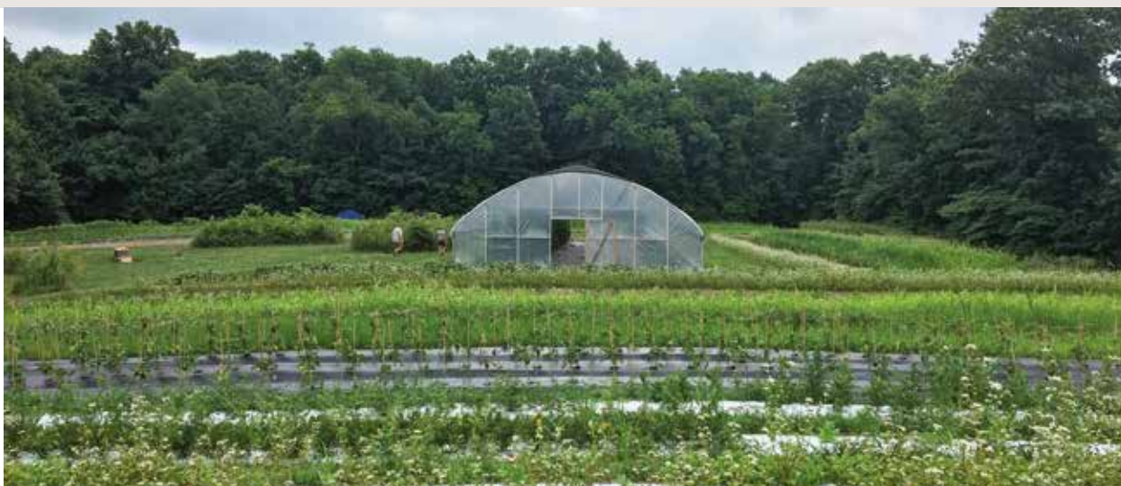
Hart Beet Farm in Eolia, Missouri, one of the environmentally-responsible farms in Known & Grown.

outreach, coordinating work group meetings, and executing most of the work groups' action items between meetings. During this initial two-year period most STLFPC members provided input and feedback on the action items that needed to be moved forward in the work groups and helped recruit new members. During the same period, MCE also secured a federal government grant to hire a full-time person to support the farmer-focused work group specifically and funding to hire an AmeriCorps VISTA – a year-long volunteer – to support the food access work group specifically. This allowed for significantly increased efficiency in executing the strategies of those work groups. At the end of the two-year advocacy grant, the private foundation funded a one-year extension of that grant, allowing the work to continue. After the AmeriCorps VISTA's year of service, another private foundation in St Louis committed to funding a full-time position at MCE to continue the community-led food access work.