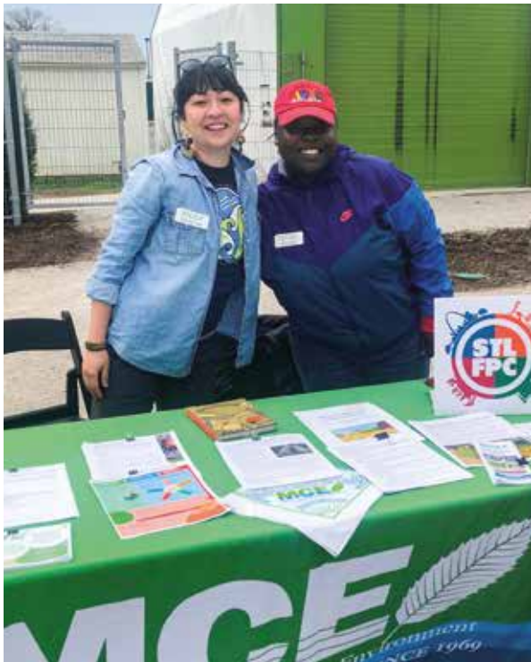
Urban Ag Day at the St. Louis Science Center.