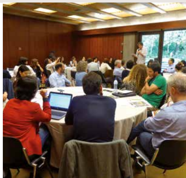
RUAF meeting at Fundação Gulbenkian in Lisbon, Portugal (2018).