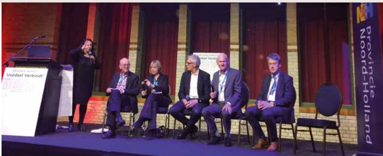
Food Council MRA meeting in 2017.

for the municipality, ended up on the shelf. After the most recent local elections in 2018, the political situation in the city changed drastically again, this time in favour of the left-wing parties. The new municipal government has announced that a food strategy will be published in 2019, building on the 2014 food vision. The strategy will introduce implementation devices at city and neighbourhood level.