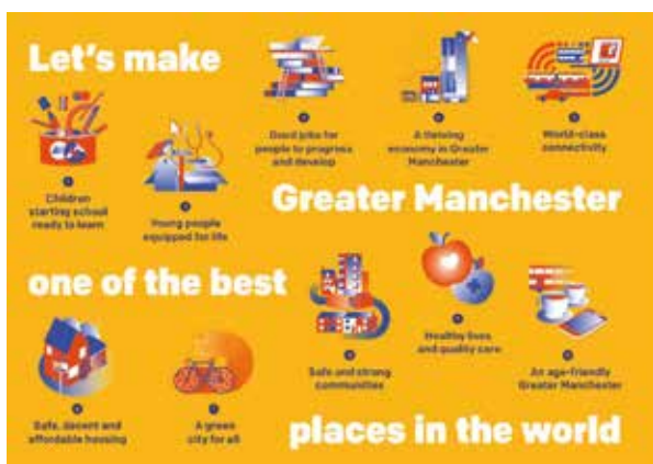
Greater Manchester Strategy, "Our People, Our Place". GMCA 2017

In Greater Manchester, sustainable food has not played a prominent role in political discourse until relatively recently. Its absence is notable in the Greater Manchester Strategy, Our People Our Place , which was refreshed in 2017 following the establishment of a new directly elected mayor for the region. The strategy sets out ambitions for the future development of Greater Manchester around ten key themes but makes no mention of sustainable food at all. Food is referenced only twice, both times in relation to the food and drink manufacturing sector and its role in the local industrial strategy. This reflects a tendency to view food through an economic lens, which may inhibit our ability to take a more holistic approach to food policy that considers other areas of our lives such as health, well-being, social justice and community.