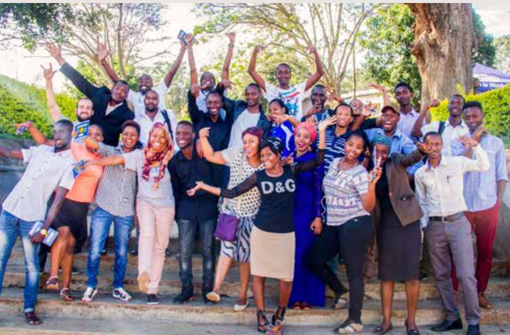
Empowering changemakers in Tanzania.