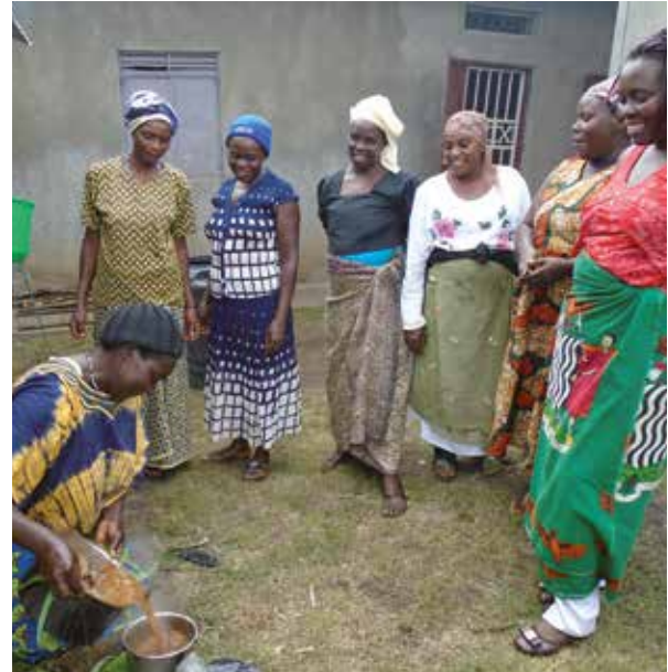
Cooking demonstration by Orugali women.

The Zambia Food Change Lab began in Chongwe District at the local level. It was set up in 2015 to address the problem of limited diversity on Zambian farms and in local diets. The Chongwe Food Lab soon evolved into the Zambia Food Change Lab in 2016, which was broader in scope and looked at national challenges in the Zambian food system. This occurred after adding partners with a national focus and realising that agricultural policy issues were quite central to achieving change in the local food system. The national-level lab developed a food system map to identify challenges and opportunities for change in production, consumption, processing and access to food. From this mapping, they formed four prototype groups to address selected challenges where points of leverage had been identified. The four groups, whose members were from the national lab, focused on