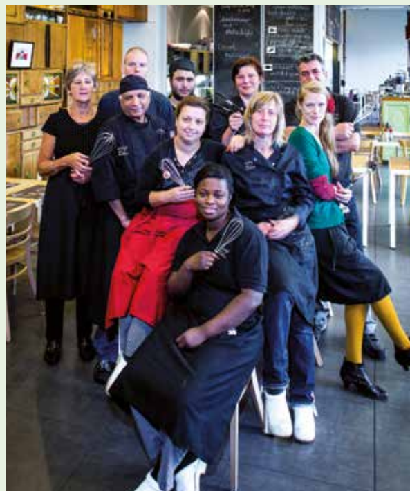
Gent en Garde Kitchen Brigade.

One working group translated the strategic goals into operational goals. After its work was completed, two other working groups started putting the specific operational