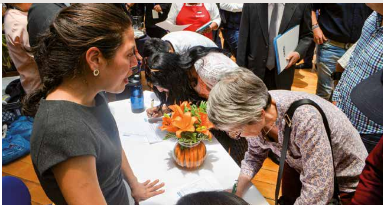
Signing the Agri-Food Charter of Quito.

system, its vulnerabilities and its response capacity, consolidating the different instruments of the policy and providing a strategic vision to the agri-food system.