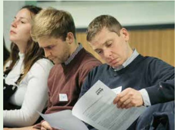
Food strategy meeting.

This happened during three stakeholder meetings, each hosting 50 to 70 participants on a voluntary basis. During these workshops the strategic and operational goals were