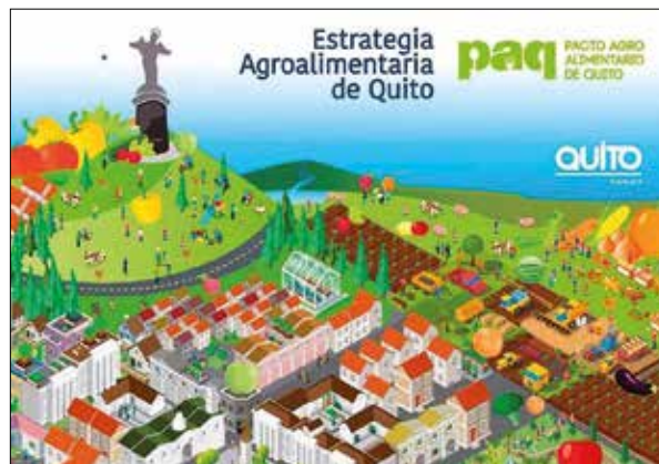
The agri-food strategy of Quito.

The Municipality of the Metropolitan District of Quito has a long history of promoting urban and peri-urban food production. In 2000, with the support of the Habitat Urban Management Program for Latin America and the Caribbean, the municipality began promoting urban gardens that were quickly consolidated in the Participatory Urban Agriculture Program. Currently, AGRUPAR covers 1,400 urban orchards that occupy approximately 40 hectares of urban, peri-urban