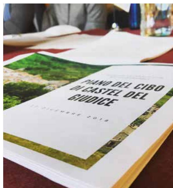
Draft document of the local food policy.