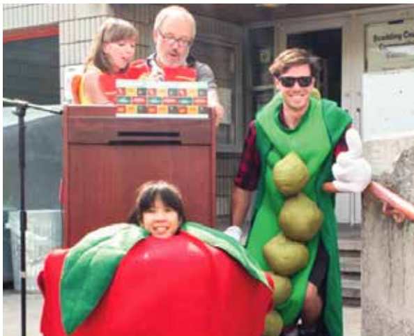
Proclamation of first Urban Ag Day in Toronto in 2017.

3 Food is multifunctional and can solve many city problems. Multifunctionality was first associated with agriculture, referring to the fact that agricultural production can produce ecosystem services and social benefits beyond the production of food and fibre. But thinking of food more broadly as multifunctional is a bedrock of critical food guidance. There are two reasons for this. One is that multifunctionality opens food to the economies of scope, not the economies of scale. Scale economies mean food producers are on a treadmill of producing more to keep their prices down so they can sell cheap. Scope economies mean part of the value of a green roof comes from harbouring endangered pollinators, part of its value comes from keeping rain on the roof to be soaked