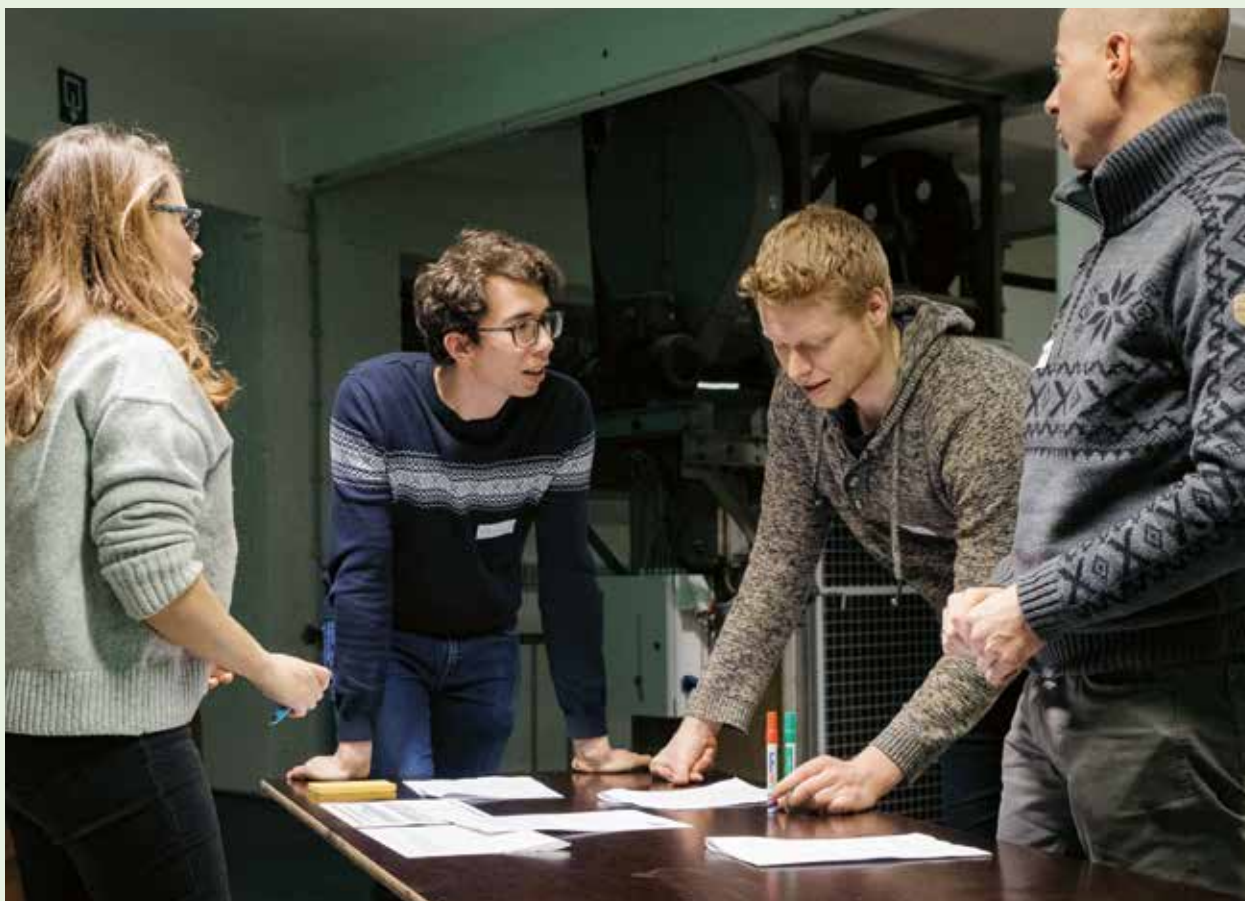
Food strategy meeting in Leuven.

Some FPCs are instigated by civil society groups that seek to engage local government actors; others are created through local government procedures. Some, such as the Bristol Food Policy Council, come about as a result of both top down action by government and bottom-up community action. Stahlbrand and Roberts, in their contribution on Toronto (page 11), reflect on 30 years of experience with adapting and including top-down and bottom-up forces that “we are no longer talking about food policy in the abstract, but food policy that engages with the city as a living and breathing force in its own right”. They provide six pillars of critical food guidance that shape the evolution of food policy councils.