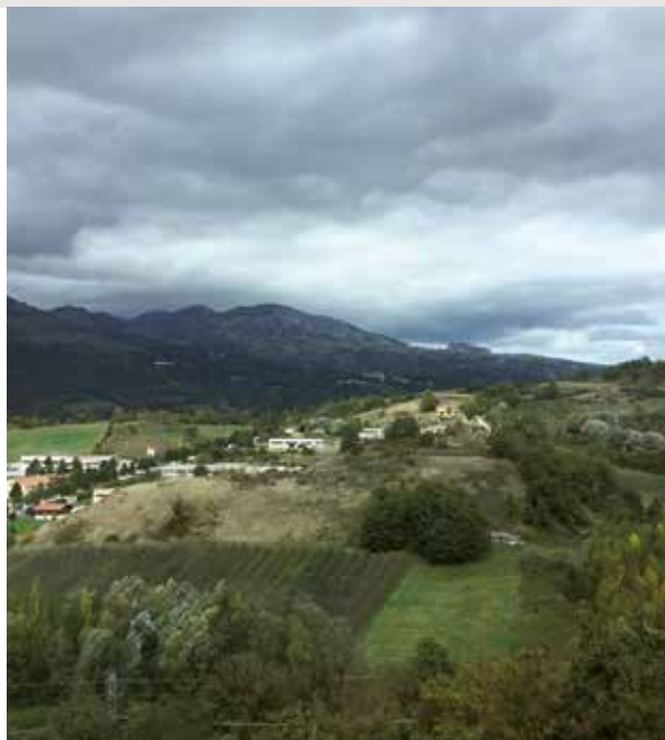
Castel del Giudice, Molise.

The food policy for Castel del Giudice was set together with stakeholders, and the mayor was present during all the sessions. Several drafts of the document were circulated among the group, and at the beginning of March 2019, the final version was approved by the Municipal Council. Briefly, the food policy contains four main lines of action, for a total of 17 projects: from social agriculture to short food supply chains, from the valorisation of typical products to sustainable and slow tourism, from food district to environmental measures.